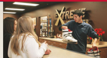
Extreme Ice Center

Let us help you design your space. With a simple layout of your room and the number of skates you intend to inventory, we'll give you a complete rental skate storage solution! Call 800.234.5522 today.